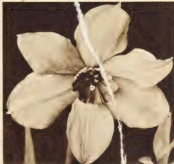
THE CHALICE CUP DAFFODILS